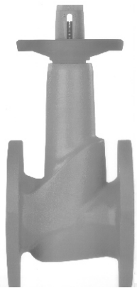
Art. 007.0414 Art. 007.0415